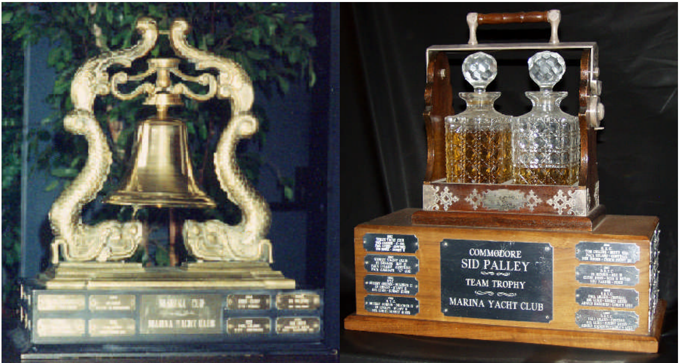
MARINA CUP TROPHY