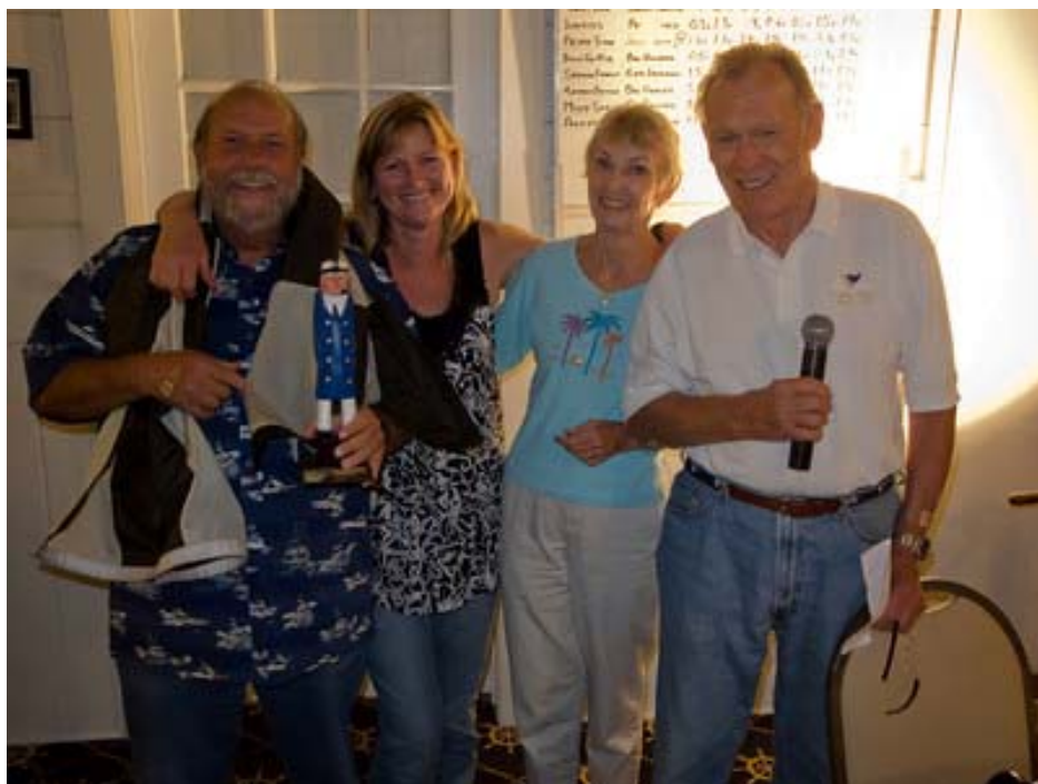
"RAMSEY" Cruiser Navigation Contest