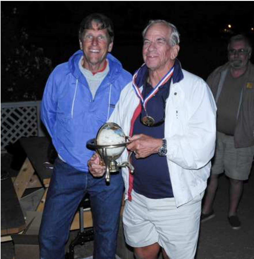
JACK KALO MEMORIAL Cruiser Navigation Contest