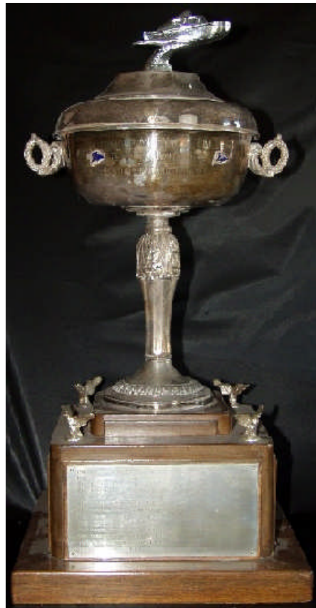
SHARKIE PERPETUAL TROPHY